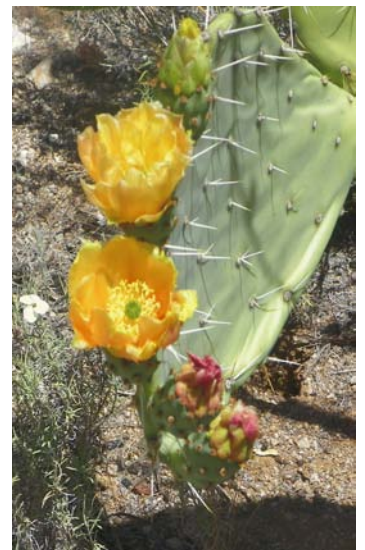
Prickly pear in our backyard