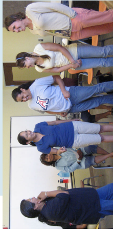
Students & Instructors during Microteaching Orientation 2008.

"MICROTEACHING WAS A CHALLENGING AND EXPOSING EXPERIENCE. IT EXPOSED AREAS WHERE I NEEDED TO GROW AS A TEACHER AND A LANGUAGE LEARNER. IT ALSO CHALLENGED ME TO CONTINUE LEARNING - IT CAN ONLY GET BETTER."