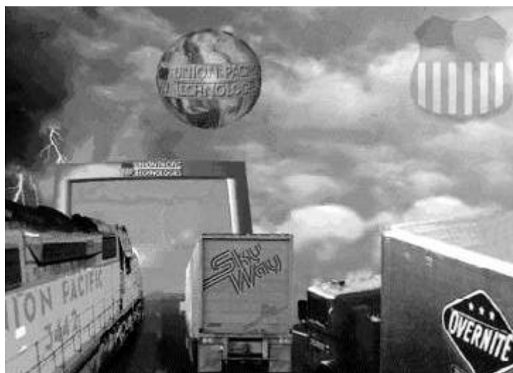
Figure 3: Union Pacific Technologies' Background

Drawing on UP Technologies' image in Figure 3 (UP Corporation, 1998c), we can see yet another of the ways UP constructs itself through its website.